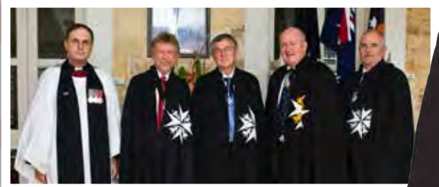
Investiture of the new Deputy Prior and Patron