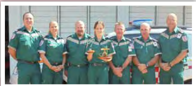
NT Honoured with National Awards