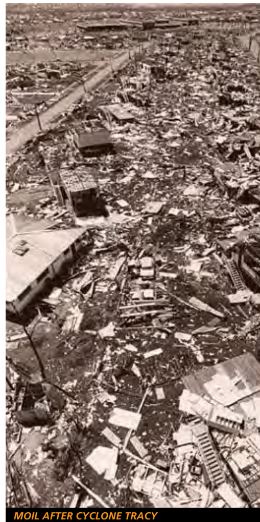
MOIL AFTER CYCLONE TRACY