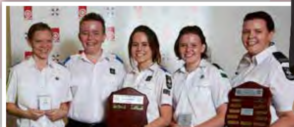
2014 Volunteer Award Presentation